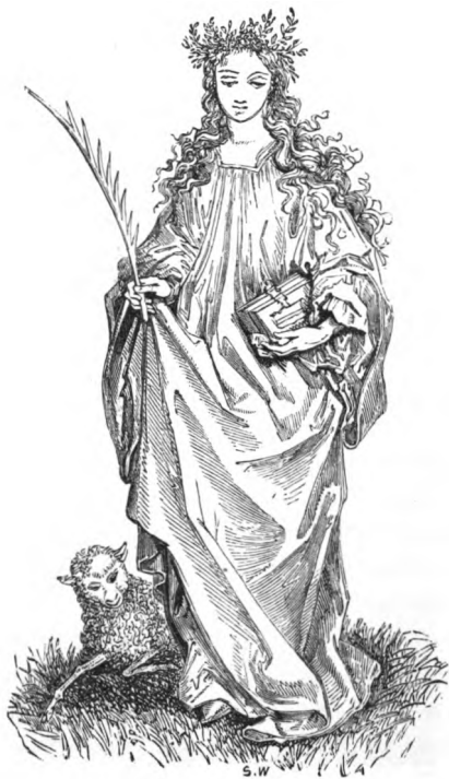
S. Agnes ( Martin Schoen ).

and indeed, some of these great writers relate her history in detail. She was the daughter of Christian parents of high birth. They seem to have been truly religious, and